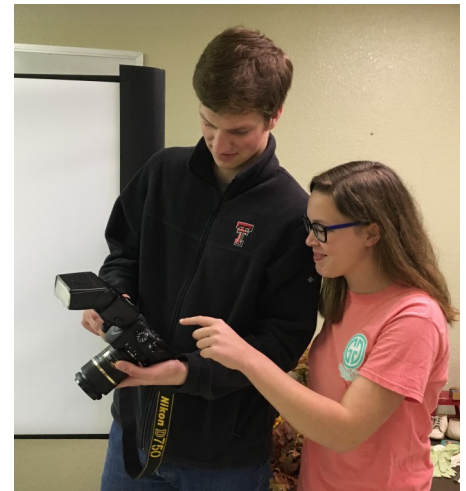
Texas 4-H Photography Ambassadors review camera settings at a photography workshop.